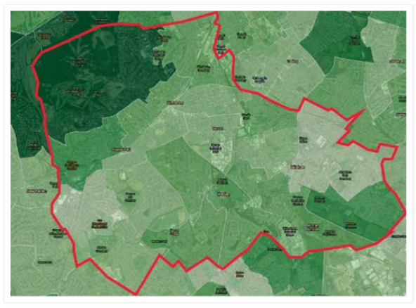
Figure 2 – Tree canopy cover distribution in Merton by Ward (pre-2022 Merton Ward boundary changes 2022). Darker green indicates more tree cover

But as you will see from (Figure 2 Map) showing tree canopy distribution and (Figure 3 Graph) showing % Tree Canopy cover in Merton by Ward shows that nearly all wards in Merton have a tree canopy cover below the London average of 21%